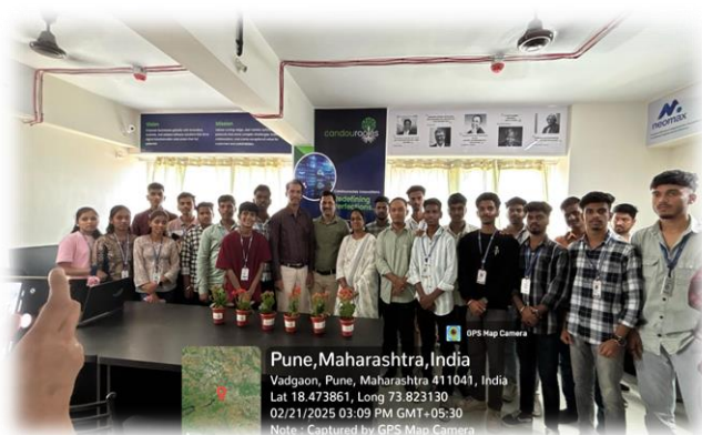
Comp. Tech. staff along with SYCO, TYCO student for Industrial Visit at Canderoutes innovations, pune